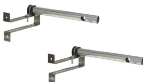
GF-2200 Airflow Measurement Station

Model GF-2200-A includes dual airflow/temperature probes and a transmitter with dual selectable analog/PID control signal output options: