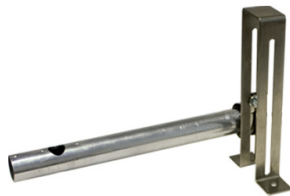
S110 Sensor Probe and Universal Mounting Bracket